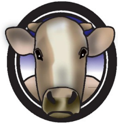
Disease on Livestock Exodus 9:1-7