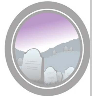
Death of First-Born Exodus 11:1-12:36