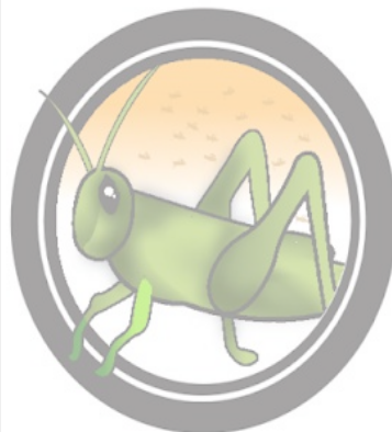
Locusts Exodus 10:1-20