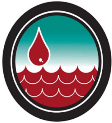
Waters Turn to Blood Exodus 7:14-25