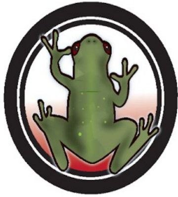
Amphibians (Frogs) Exodus 7:26-8:11