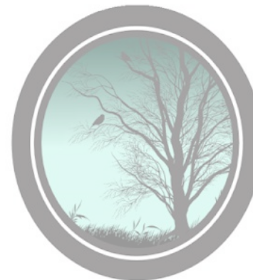
Darkness Exodus 10:21-29