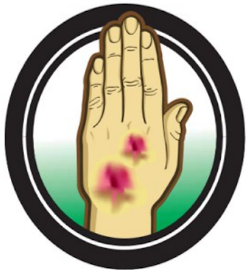
Unhealable Boils Exodus 9:8-12